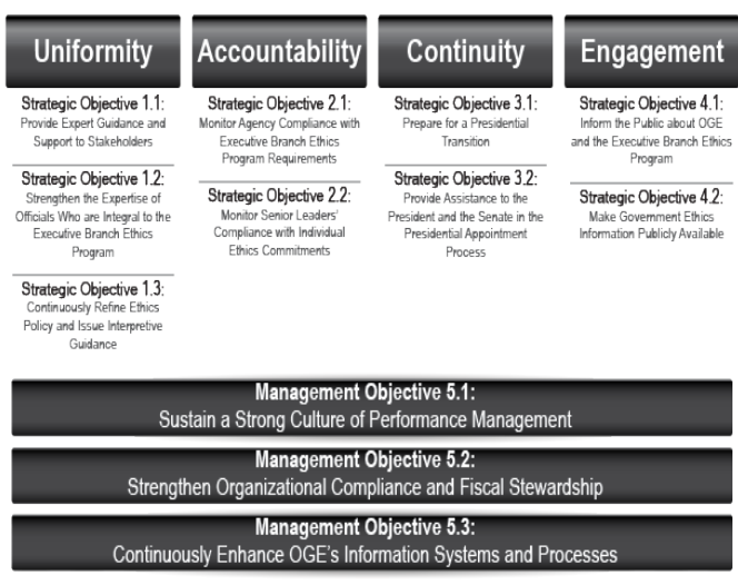
Figure 4: Strategic Goals and Objectives Framework

Strategic Goal IV: Engage the Public in Overseeing Government Integrity