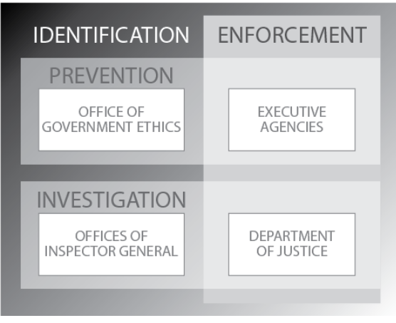
Figure 1: Institutional Integrity

The Ethics in Government Act charges OGE with leading the effort to prevent conflicts of interest in the executive branch. OGE undertakes this important prevention mission as part of a framework comprising executive branch agencies and entities whose work focuses on institutional integrity. In addition to government ethics, this framework