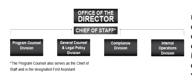
Figure 3: OGE Organizational Chart

OGE's greatest resource is its multidisciplinary staff of attorneys, ethics and financial experts, and other key personnel. OGE is a lean organization, operating at fewer than its 80 authorized full-time equivalents. OGE is led by a Director who is appointed to a five-year term by the President and confirmed by the Senate.<sup>1</sup> As shown in the